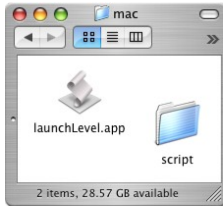
Figure 1: Double-click to start the level program

The Mac system script will also be zipped with one other file. Browse to the “mac” folder and double-click “launchLevel.app.” This will launch R, X11, and run the level script. Note that this script application was developed and tested on a PowerMac machine running Mac OS X 10.4, Tiger.